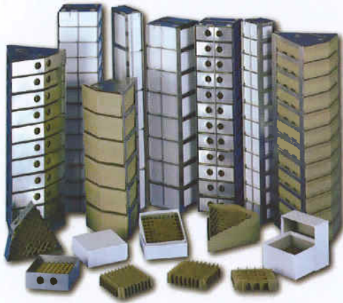
Racks, Boxes And Box Dividers For All Types Of Vial And Tube Storage.