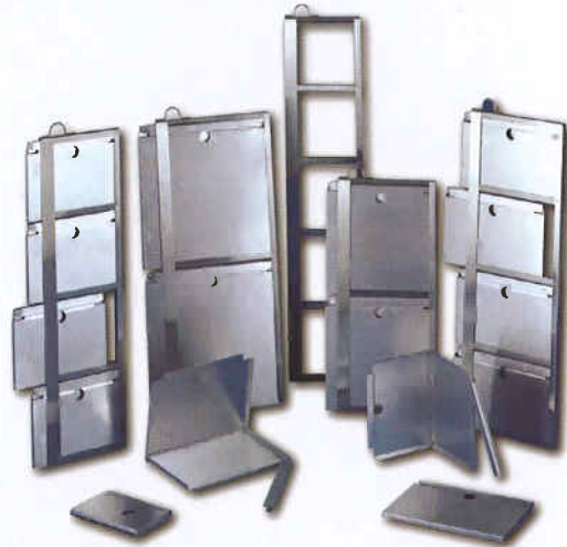
Canisters (Cassettes) And Frames For Bone Marrow, Cord Blood, And Stem Cell Storage.