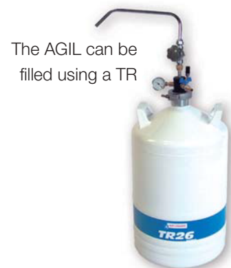
The AGIL can be filled using a TR