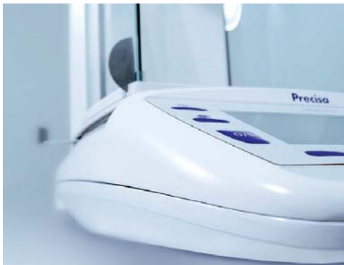
Designed along smooth, flowing lines