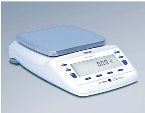
Compactly styled shape