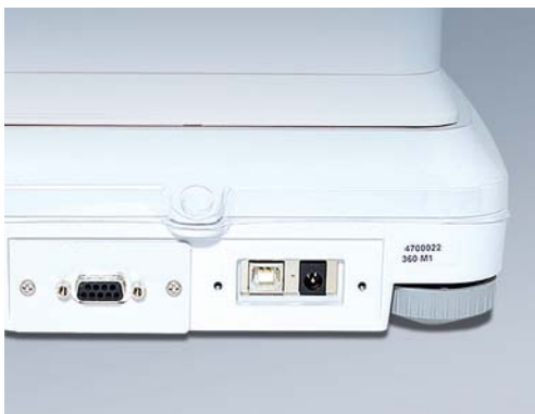
Advanced, multipurpose connectivity