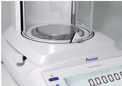
Round, ambidextrous draftshield for optimum conditions