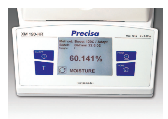
Outstanding Touch Screen Display