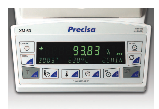
Menu-driven, screen-guided applications