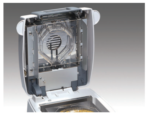
3 different radiation heat sources are optional