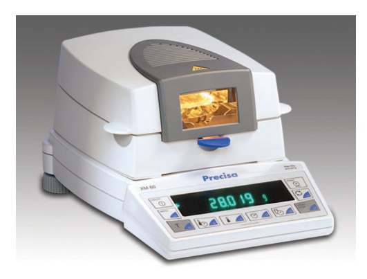
Robust and simple to operate