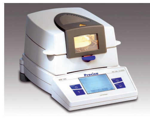
Compactly styled design