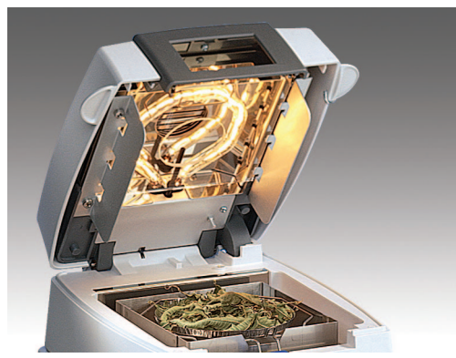
Easy sample access