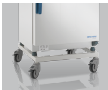
Support stand with casters