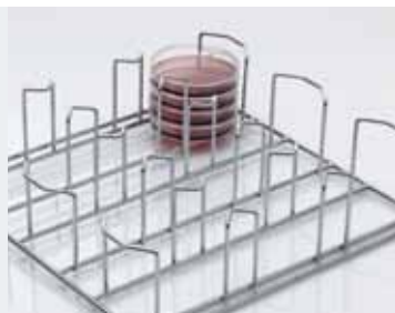
Petri dish holder