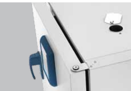
Additional access port top