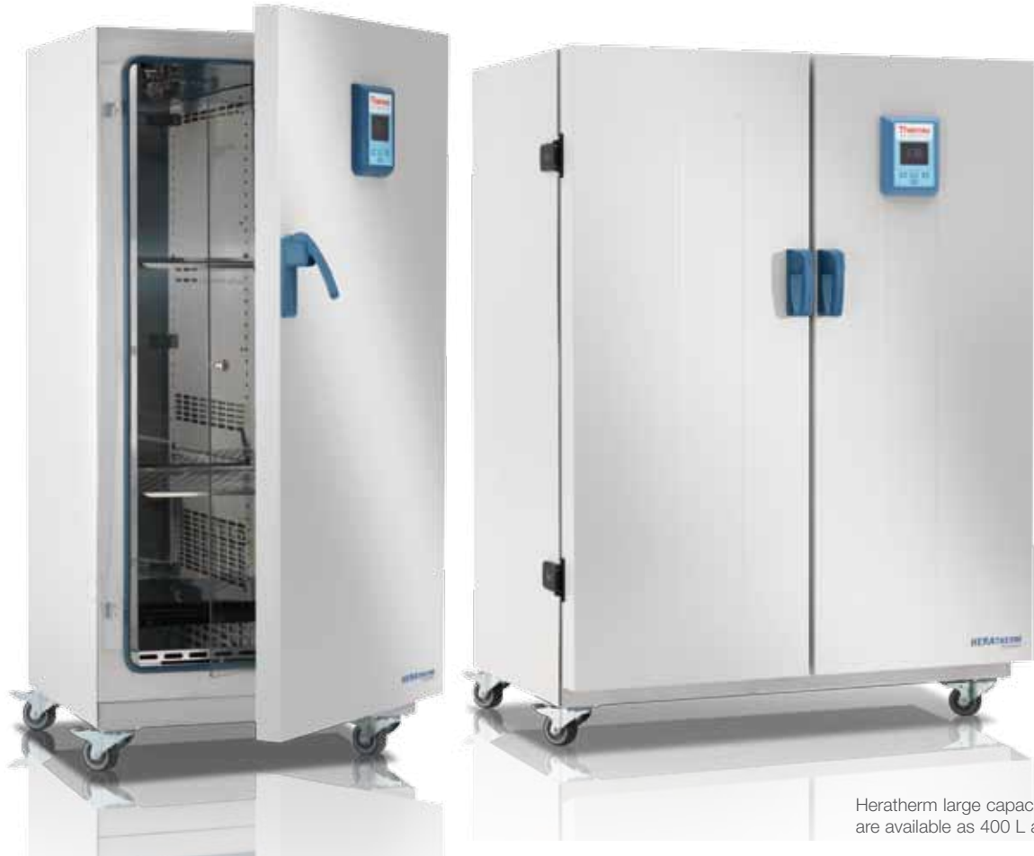
Heratherm large capacity incubators are available as 400 L and 750 L units

Designed with your need for high sample volume or larger samples in mind.