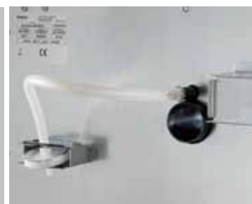
Fresh air particle Filter