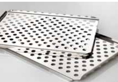
Stainless steel perforated shelves