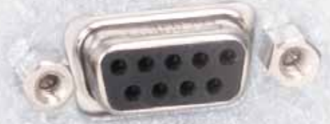
RS232 standard on all GP, AP, and APS models/sizes

Heratherm incubators offer exceptional data monitoring systems that provide the key to reliable results.