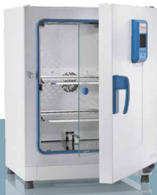
Thermo Scientific Heratherm Advanced Protocol microbiological incubator with unique dual convection