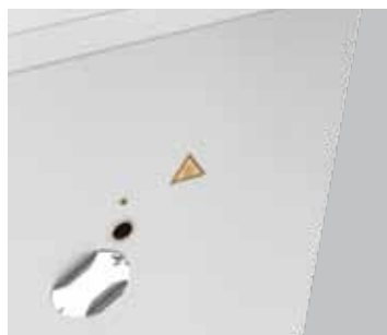
Additional access port right