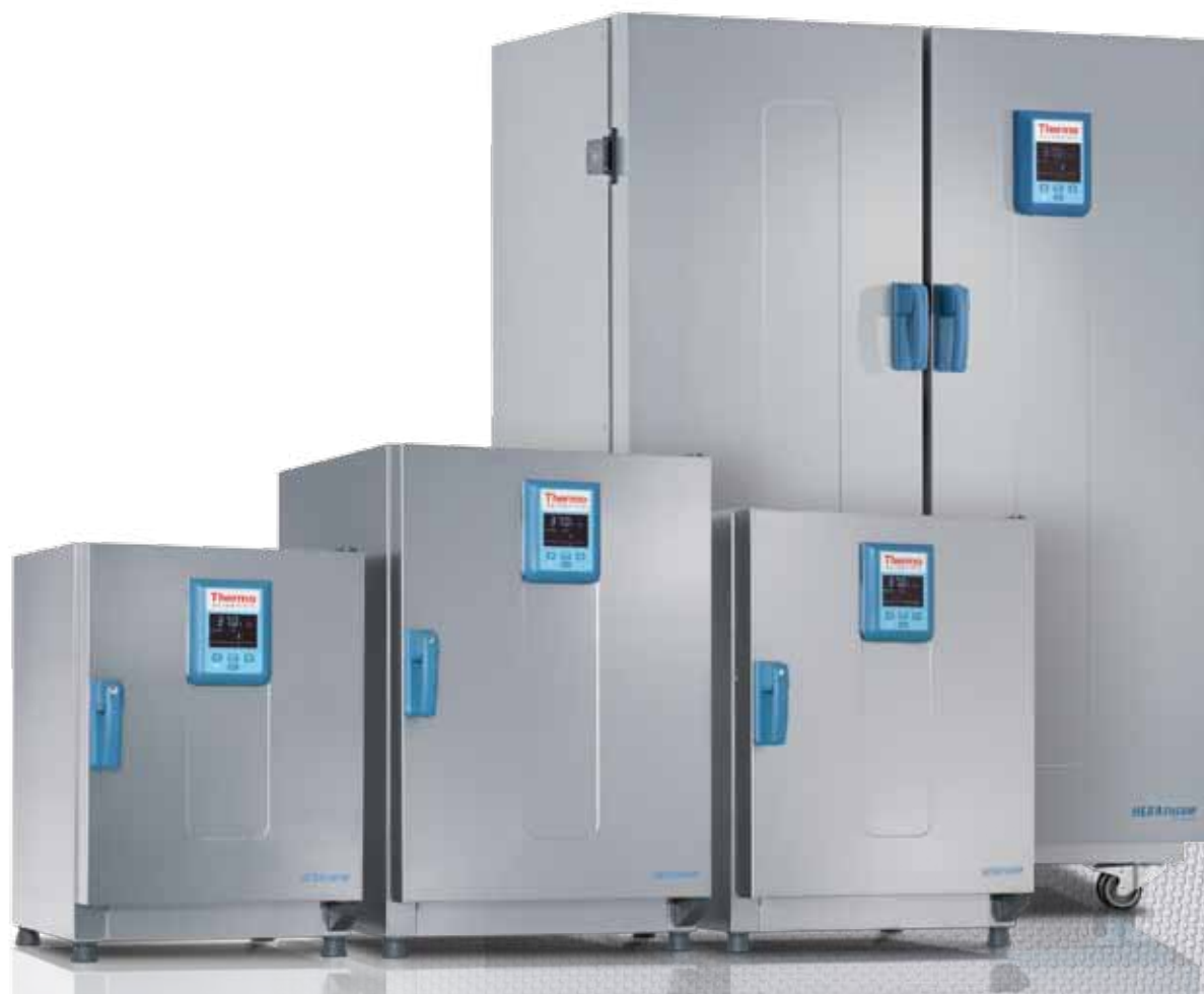
Heratherm Advanced Protocol Security microbiological incubators with stainless steel exterior

An optional stainless steel exterior is available for the Advanced Protocol and Advanced Protocol Security models.