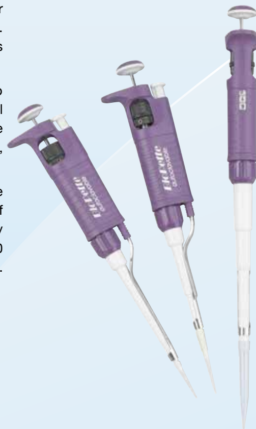
New image to come P3960-SK4

Biopettes have a universal shaft that will accept most pipette tips. The stainless steel tip ejector is adjustable to accommodate various styles of tips and removable for pipetting into narrow tubes. The Biopettes are fully autoclavable. Eight models cover the volume range from 0.1 µl to 10,000 µl. A calibration tool is included with each unit for easy in-lab recalibration. Pipettes are individually tested and supplied with a certificate of quality.