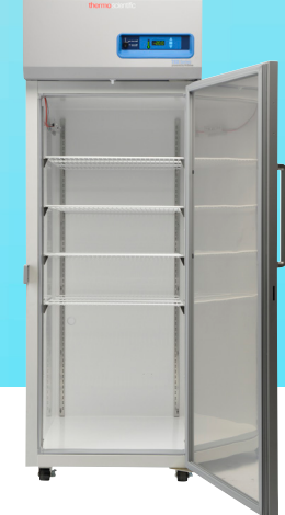
Thermo Scientific<sup>™</sup> TSX 650 litre manual defrost freezer