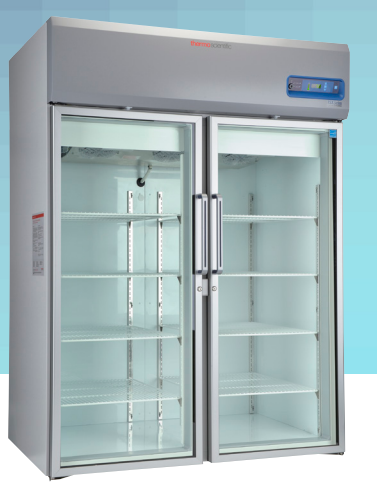
Thermo Scientific<sup>™</sup> TSX 1,447 litre refrigerator