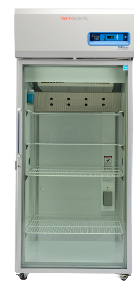
Thermo Scientific<sup>™</sup> TSX 827 litre chromatography refrigerator