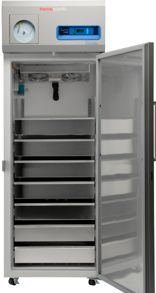
Thermo Scientific<sup>™</sup> TSX 650 litre plasma freezer

* Only V voltage models are listed under European Medical Device Directive, 93/42/EEC (Class IIa).