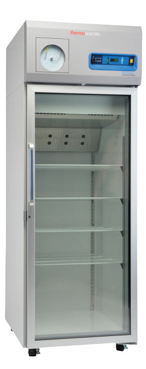
Thermo Scientific<sup>™</sup> TSX 650 litre refrigerator