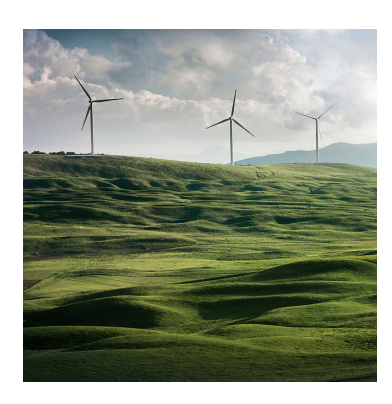
Environmentally friendly refrigerants

All professional Liebherr appliances in the Performance series are equipped with a mechanical lock with two keys for the storage of temperature-sensitive products. This way you can be sure that no unauthorised persons can access your stored goods.