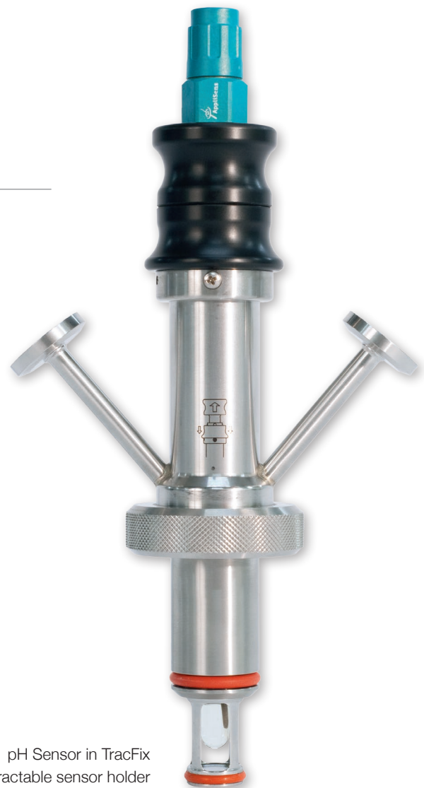
pH Sensor in TracFix retractable sensor holder