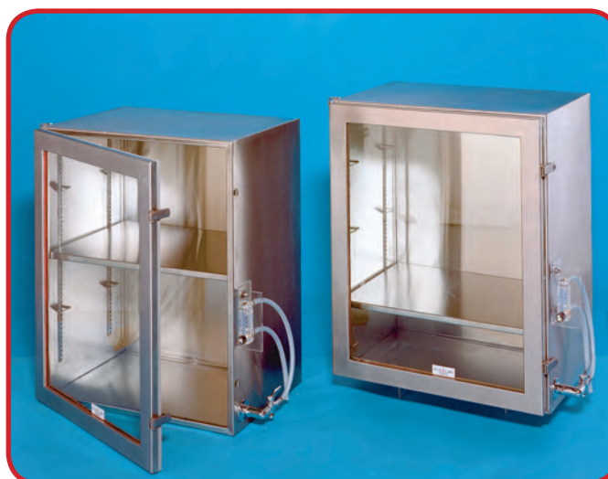
861-SS with optional 800-FLOW/D with gas valves