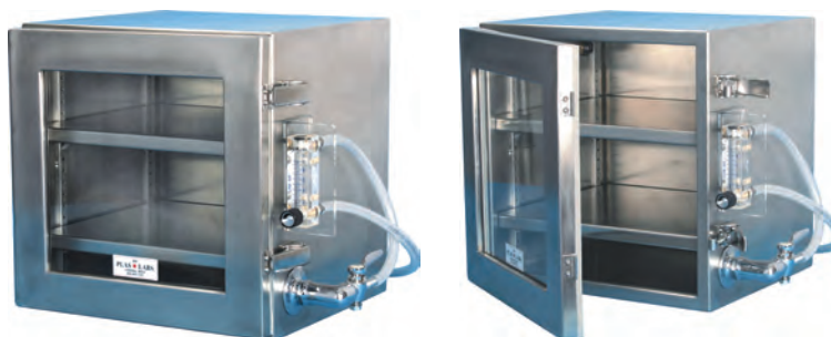
860-SS with optional 800-FLOW/D