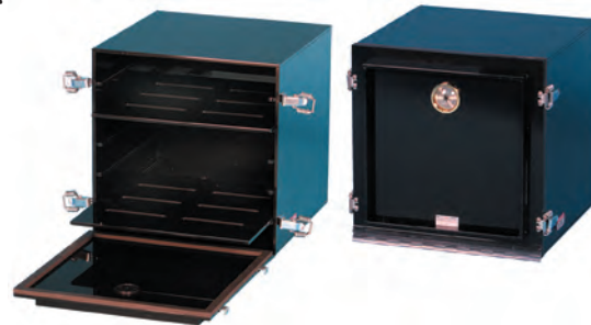
860-CGB/NS, Black Acrylic Desiccators