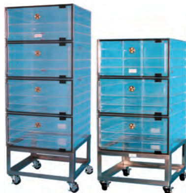
860-CG/4/NS & 860-CG/3/NS